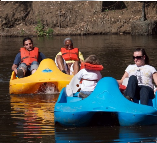
Staff get rejuvenated at the recent staff retreat at Milestones Ranch in Malibu.