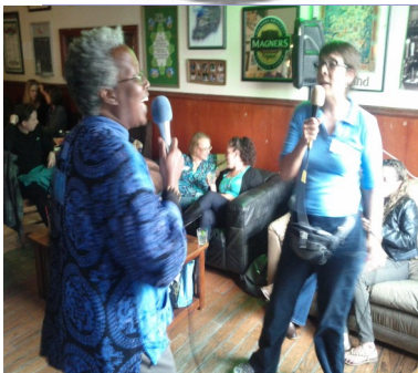
Karaoke fun at HRTC's recent event at the Dovre Club in San Francisco.

Check out our new website— it's much easier to navigate! www.harmreductiontherapy.org